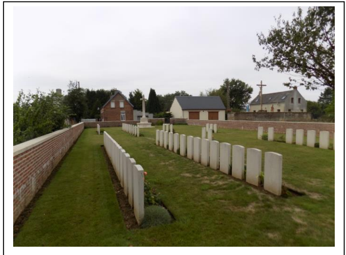
Stanley is buried at grave reference 1A.