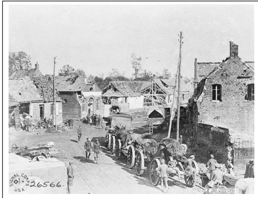
British heavy artillery passing through Montbrehain

He is buried at Calvaire Cemetery, Montbrehain, north of Saint Quentin. This village was taken on 3 October 1918, by three battalions of the Sherwood Foresters of the 46th Division, but it could not be held at the time; it was finally captured by the 21st and 24th Australian Infantry Battalions two days later. This action breached the German Hindenburg line and allowed the British to advance another 17km in the following days.